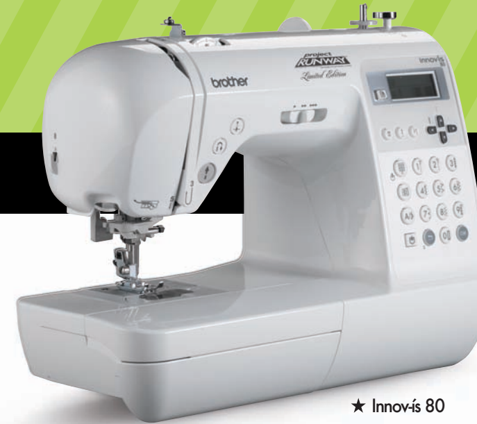
★ Innov-ís 80

Make a fashion statement, and let the Innov-ís 80 be your voice! With its diverse selection of decorative stitches, buttonhole styles, alphanumeric characters and custom stitch capability, you're not just sewing... you're creating "personal couture" with enough style and panache to satisfy the most demanding critic: you.